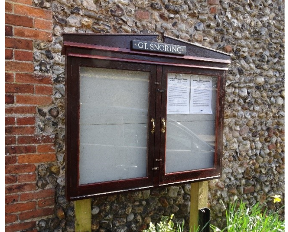
Notice board on The Street

The Noticeboard is finally back after being brilliantly refurbished by Wells Men's Shed. It was in a very sorry state but now with new wood, a completely new back section and some design improvements it should serve the village for many more years to come